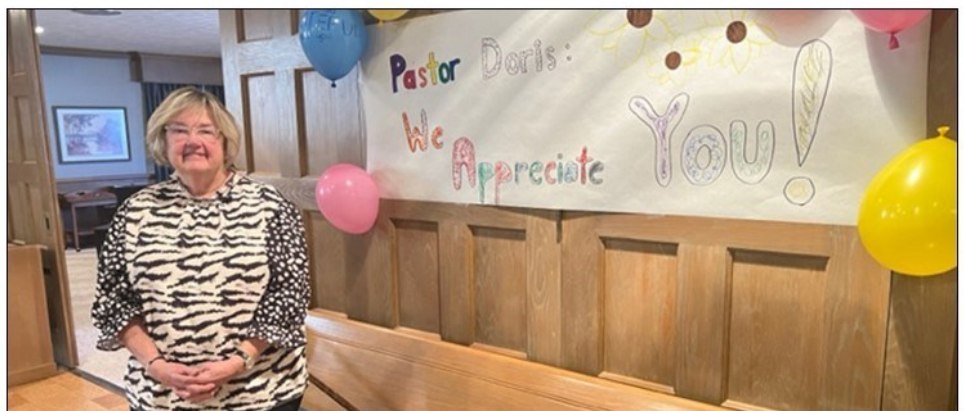
Thank you to the Confirmation class for the special sign for Pastor Appreciation Day.