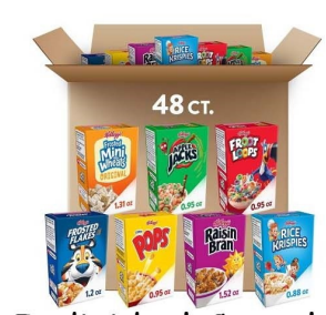
Individual Cereal Boxes